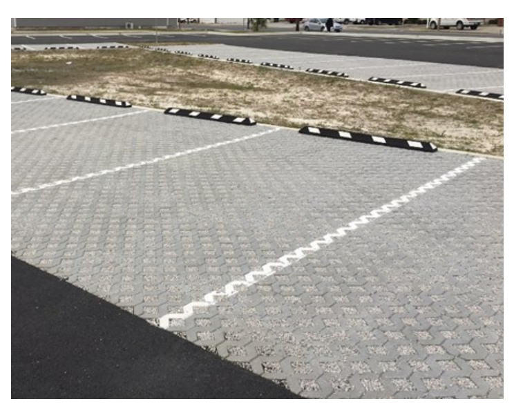
Pictured above is a permeable surface lot